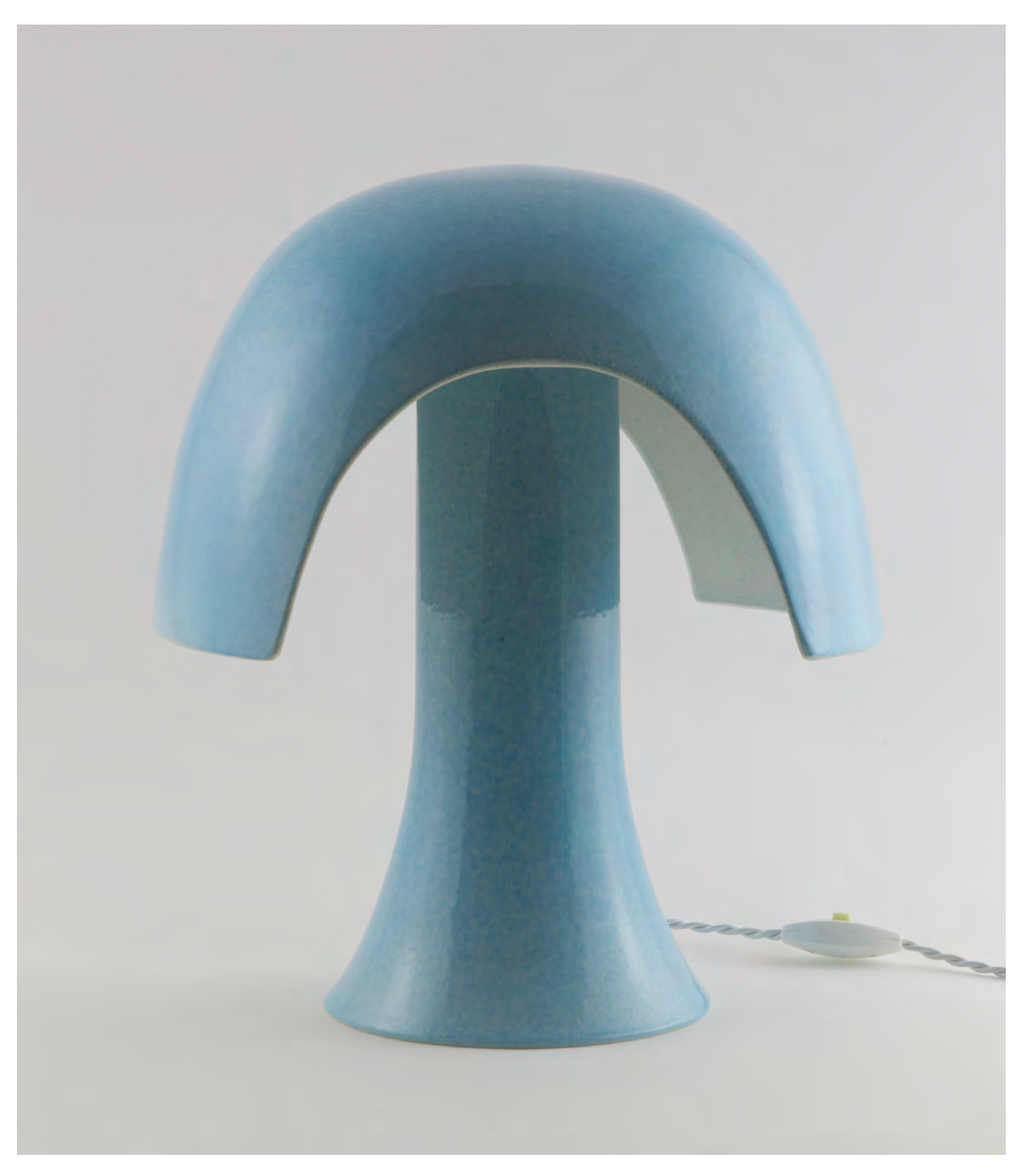
JOS DEVRIENDT Night and Day 76, 2015 Ceramic 14.2 H x 12.2 x 9.1 inches 36 H x 31 x 23 cm Unique artwork