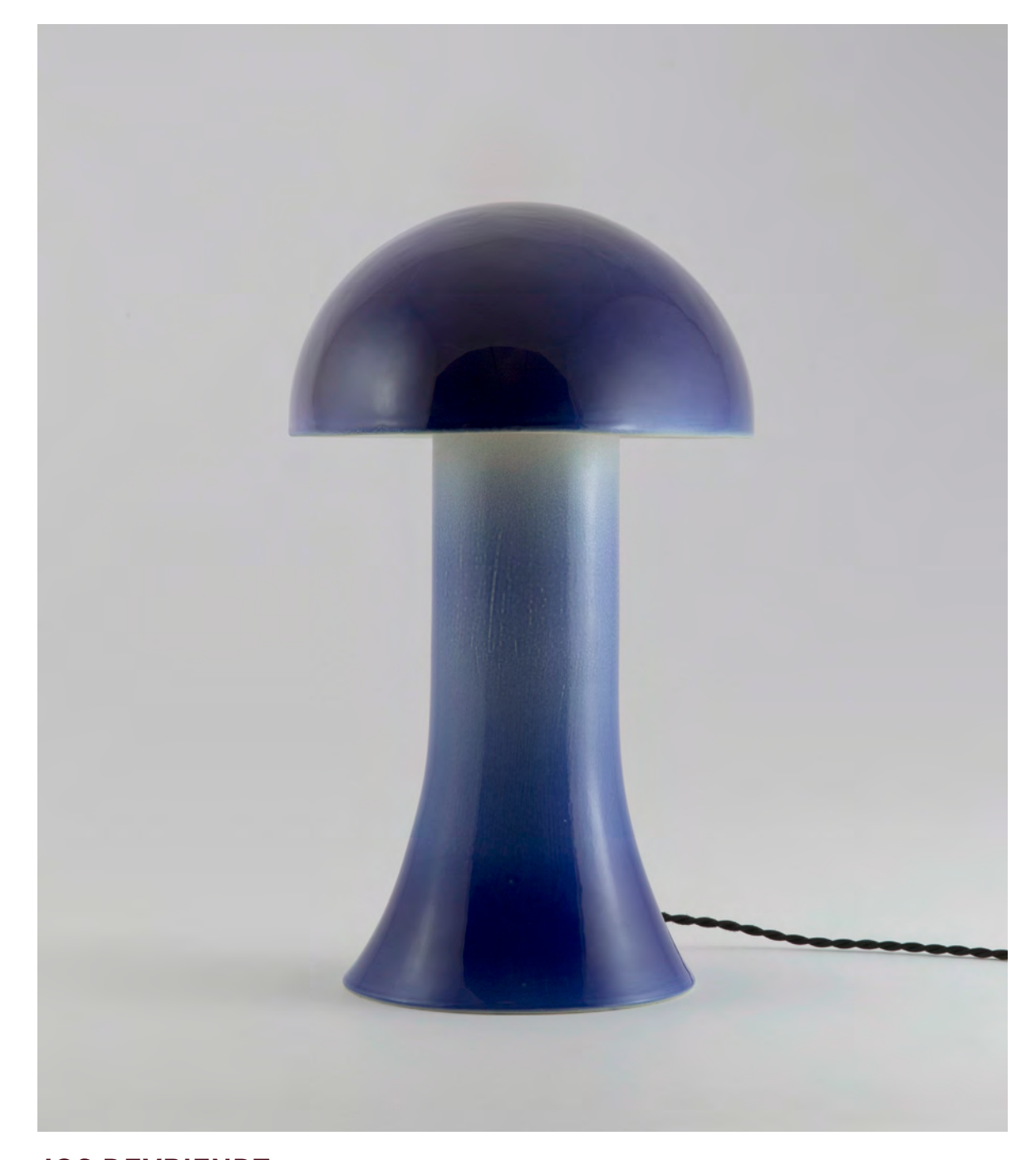
JOS DEVRIENDT Night and Day 78, 2015 Ceramic 15 H x 13 x 8.3 inches 38 H x 33 x 21 cm Unique artwork