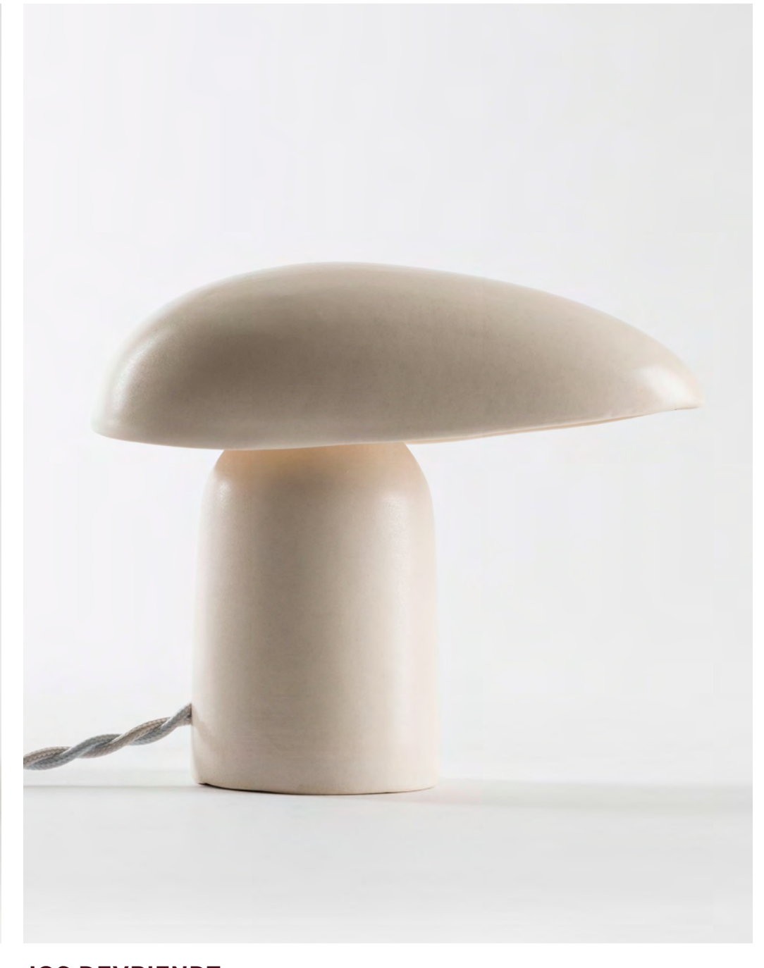
JOS DEVRIENDT Night and Day 102, 2015 Ceramic 7.1 H x 6.7 x 6.7 inches 18 H x 17 x 17 cm Unique artwork