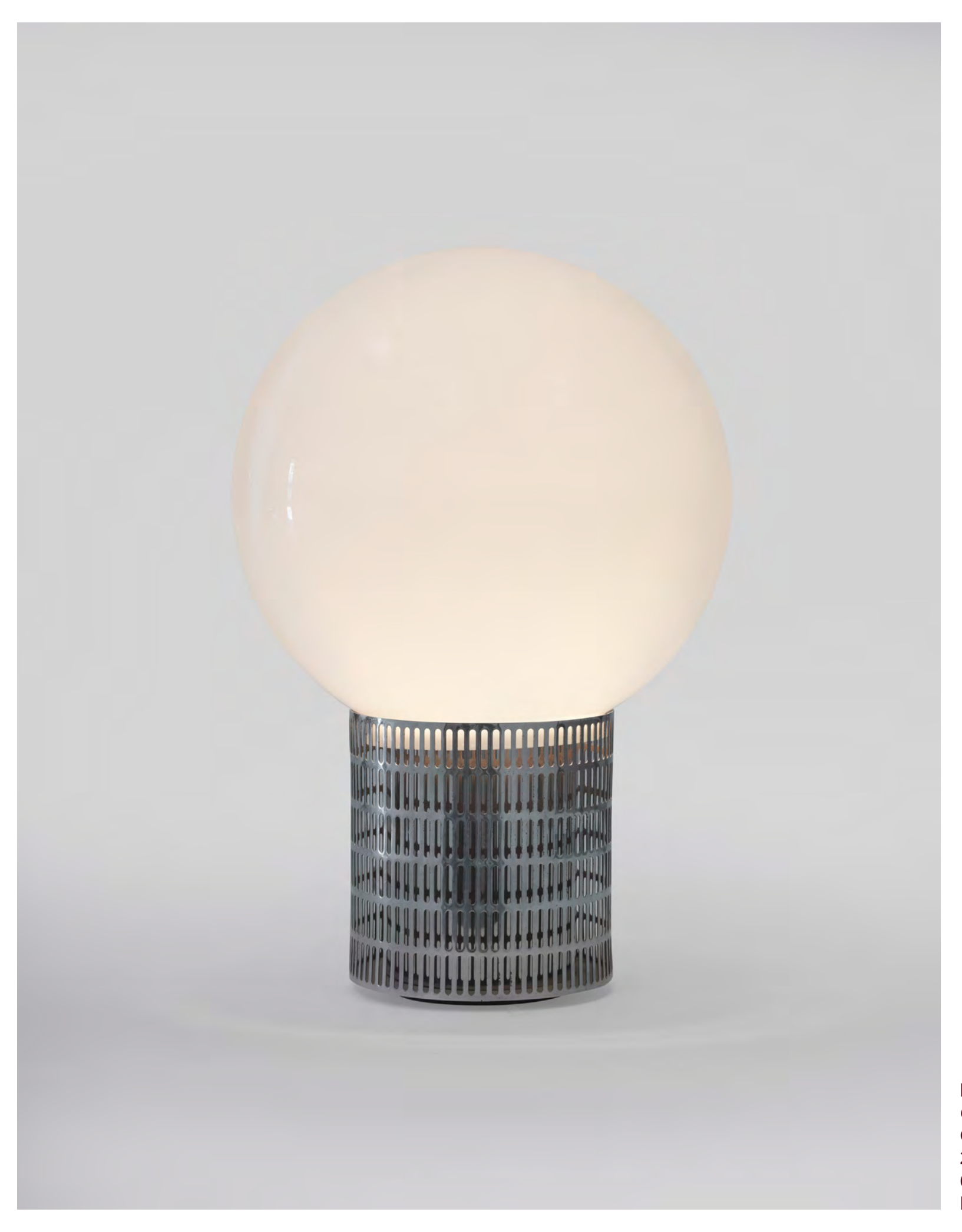
MICHEL BOYER Globe Lamp, c.1970 Glass, chrome steel 23.62 H inches 60 H cm Edition Rouve