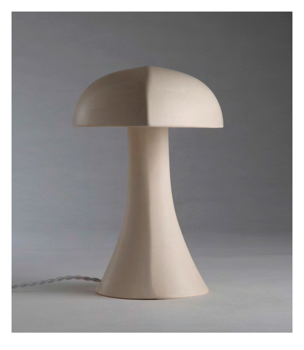
JOS DEVRIENDT Night and Day 85, 2015 Ceramic 11.4 H x 13.2 x 7.5 inches 29 H x 33.5 x 19 cm Unique artwork