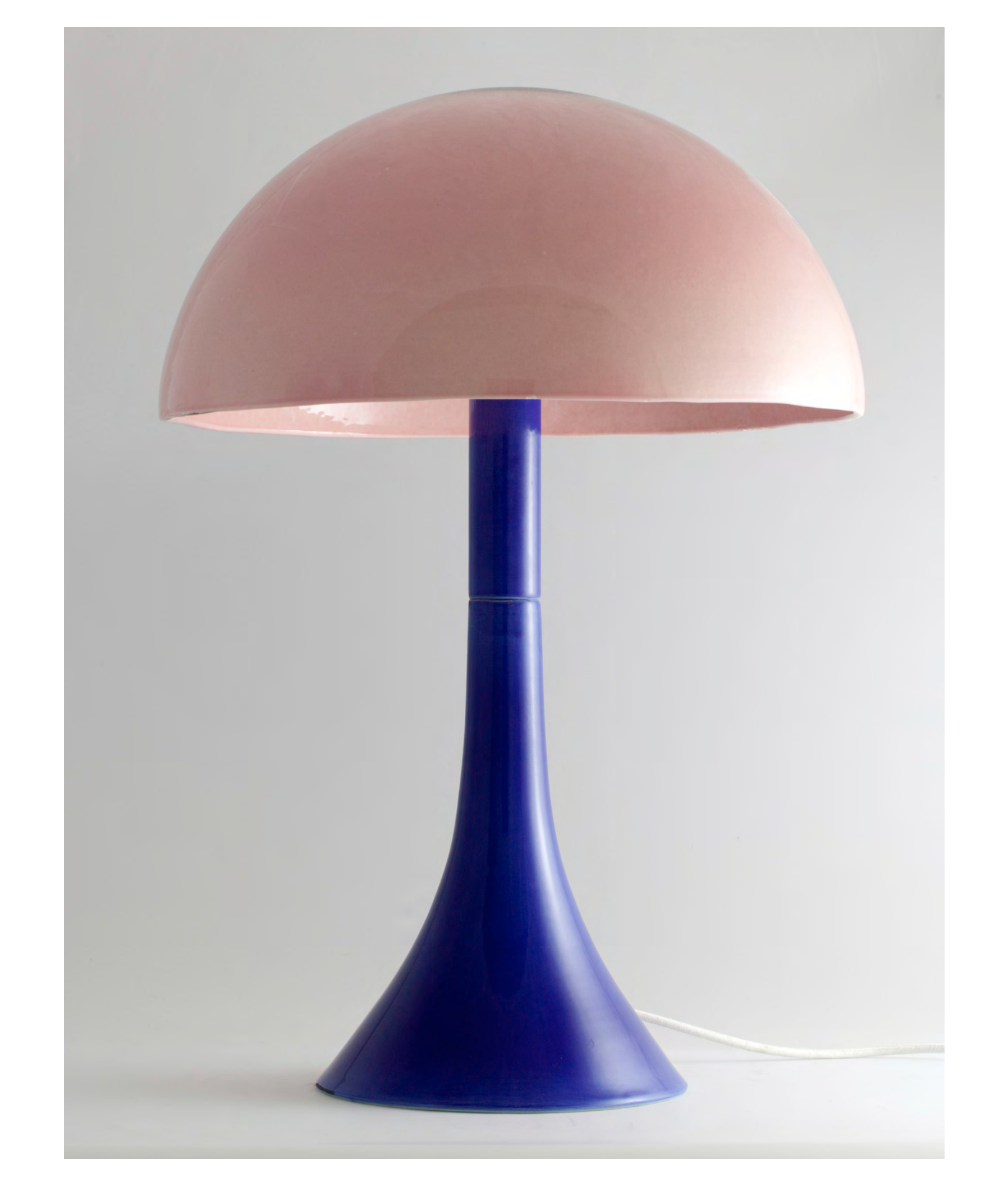
JOS DEVRIENDT Night and Day 23, 2013 Glazed Ceramic 26.8 H x 19 x 19 inches 68 H x 48 x 48 cm Unique artwork