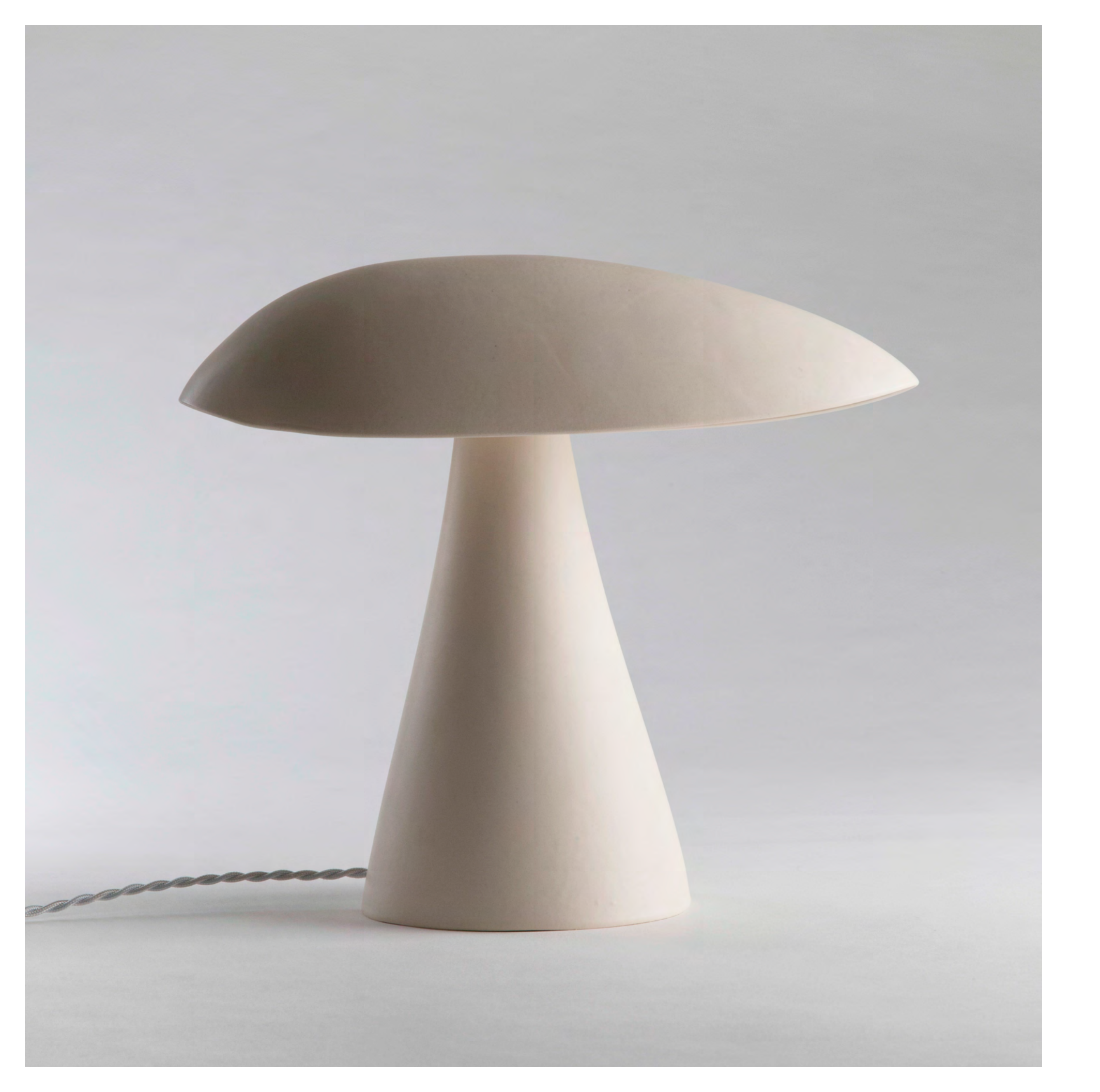
JOS DEVRIENDT Night and Day 82, 2015 Ceramic 12.2 H x 13.4 x 7.1 inches 31 H x 34 x 18 cm Unique artwork