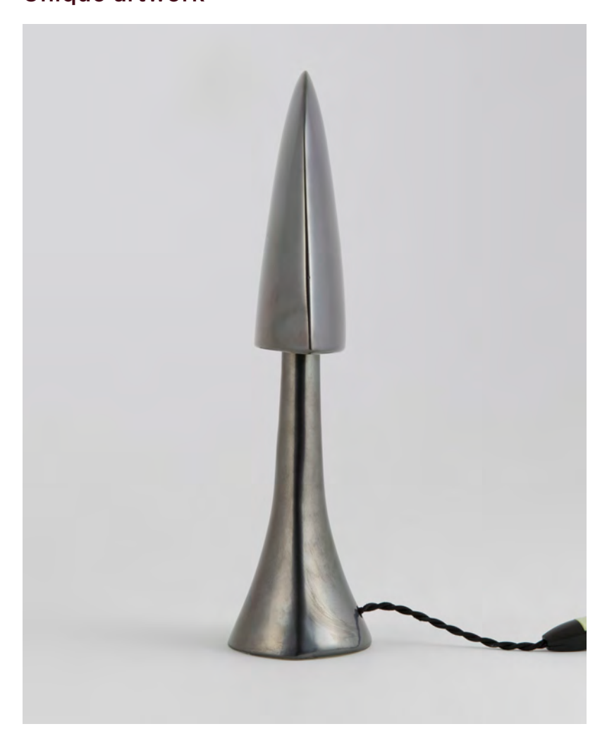
JOS DEVRIENDT Night and Day 80, 2015 Ceramic 15 H x 7.1 x 7.1 inches 38 H x 18 x 8 cm Unique artwork