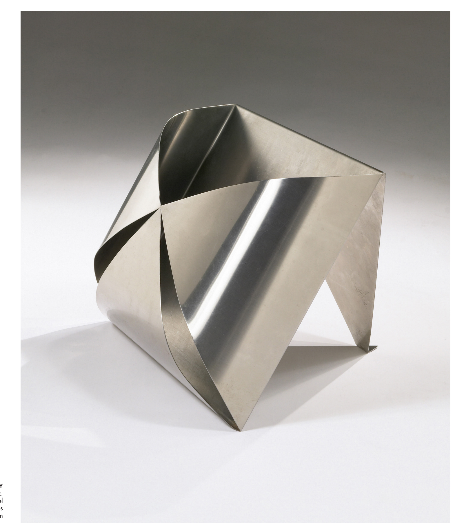
MARIA PERGAY Magazine Rack, 1970 c. Stainless steel 10.83H x 16.54 x 12.6 inches 27.5H x 42 x 32 cm