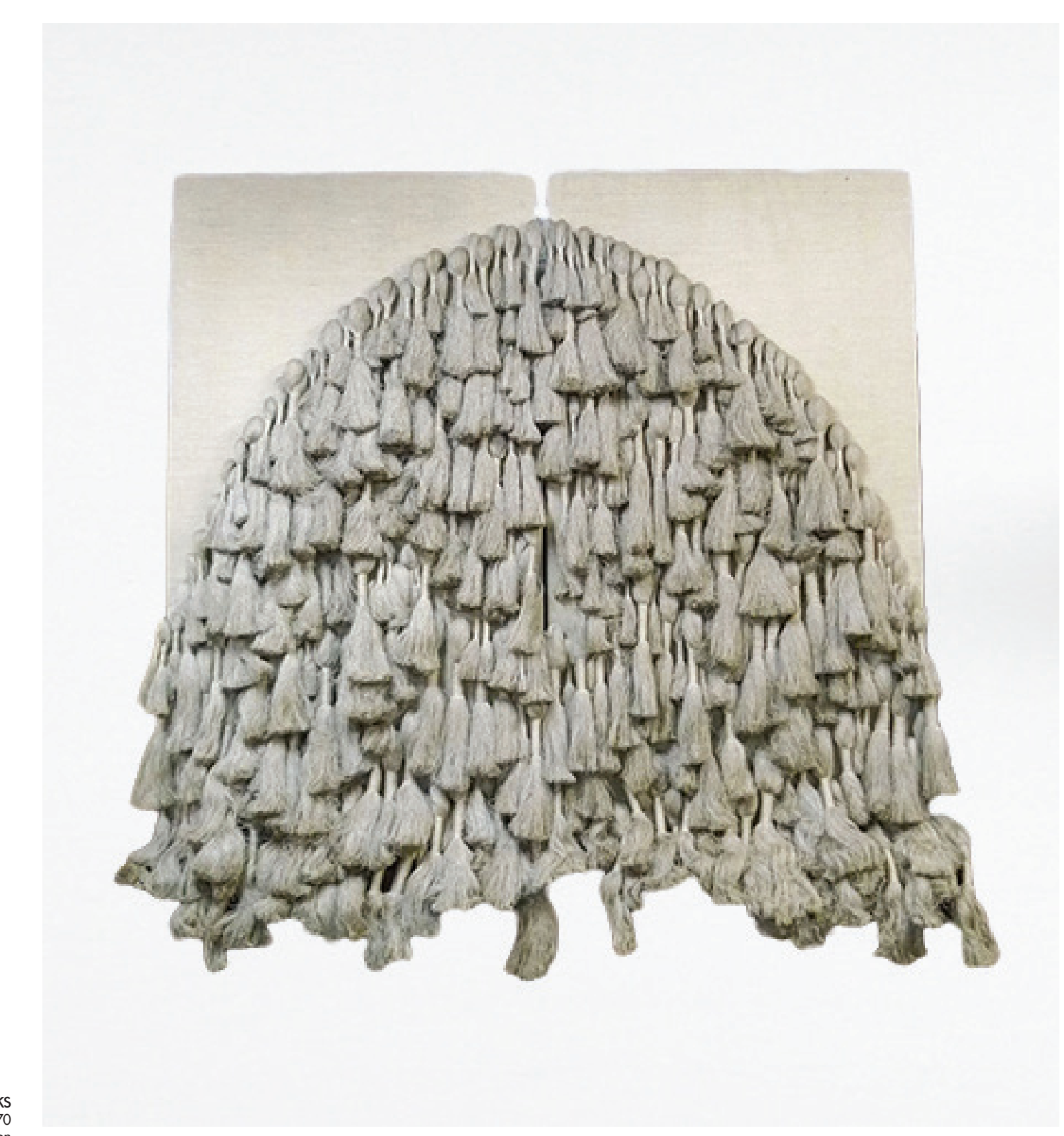
SHEILA HICKS Tapestry, c. 1970 Linen, cotton 74.8 x 74.8 inches 190 x 190 cm