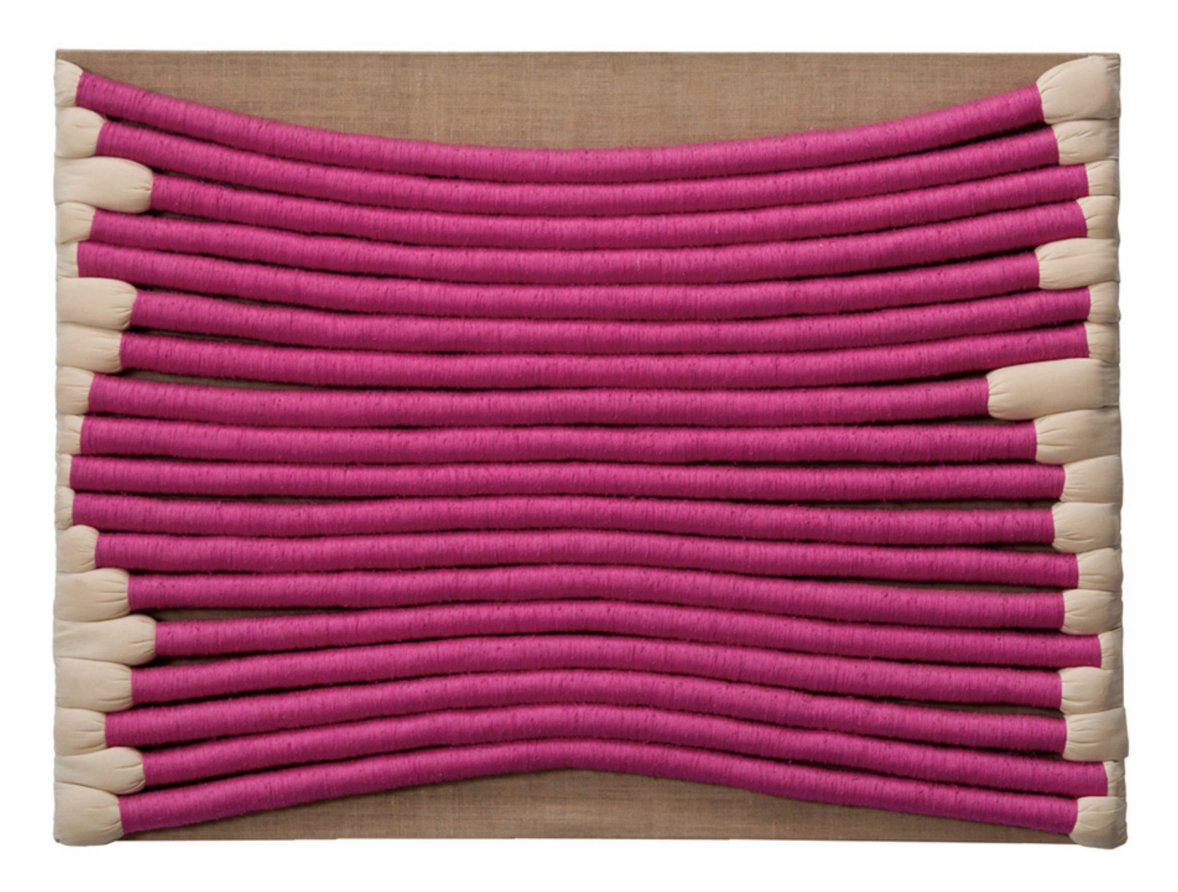
SHEILA HICKS Cord Structure, 1977 Coil-wrapped yarn on muslin backing 38.25 H x 51.33 inches 97.2 H x 130.4 cm