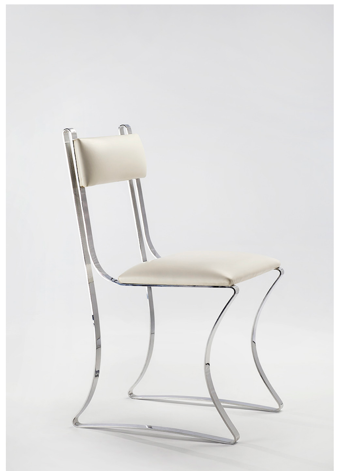
MARIA PERGAY Chaise X / X Chair, 1975 c. Stainless steel, leather 25.59 x 17.71 x 17.71 inches 65 x 45 x 45 cm Set of 4 available