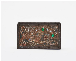
Alfred Daguet Canine Attack , c. 1897 Patinated steel, enameled and gilded copper, glass cabochons 1.5 H x 5.5 x 3.5 inches 3.8 H x 14 x 8.9 cm