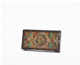
Alfred Daguet Green Treasure , Patinated steel, enameled and gilded copper, glass cabochons Patinated steel, enameled and gilded copper, glass cabochons 1.75 H x 8 x 4.25 inches 4.4 H x 20.3 x 10.8 cm