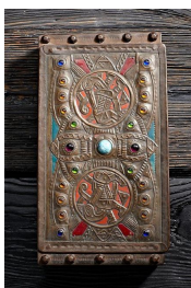
Alfred Daguet Jeweled Pelican Box , c. 1905 Patinated steel, enameled copper, glass cabochons 2 H x 9.5 x 5 inches 5.1 H x 24.1 x 12.7 cm