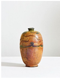
Galileo Chini Salamander Vase , c. 1900 Glazed earthenware 10.5 H x 6 D inches 26.7 H x 15.2 D cm