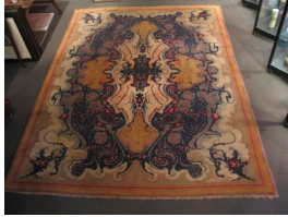
R.N. van Dael Dutch KVT Tuschinski Carpet Wool, natural fibers