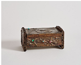
Alfred Daguet Crab Box , c. 1900 Wood, steel, gilded copper, glass cabochons 4 H x 8.25 x 4.5 inches 10.2 H x 21 x 11.4 cm