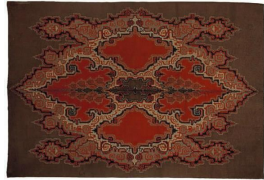
R.N. van Dael Dutch Tuschinski Carpet , 1930 Wool, natural fibers 137 x 95 inches 348 x 241.3 cm Numbered on reverse "224"