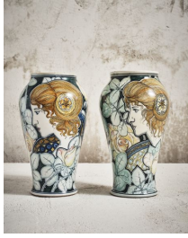
Galileo Chini Pre-Raphaelite Ladies , c. 1898 Glazed earthenware 10.3 H x 5.8 D inches 26.2 H x 14.7 D cm