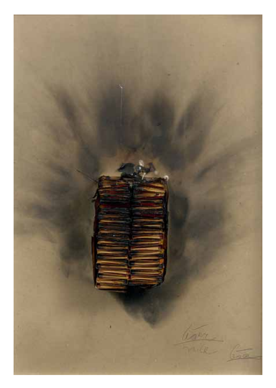
César. Combustion D'Allumettes , c. 1970s Matchbox, burnt matches and soot on cardboard 21.65 H x 15.35 inches 55 H x 39 cm Signed twice, lower right: "César, nice"

César. Julius César , 1972 Print with color pencil on paper 7.87 H x 4.92 inches 20 H x 12.5 cm Signed, dated and titled upper right: "Julius César, 1972"; signed and dated on the reverse: "César, 1972"