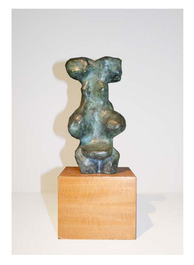
François Stahly Terre d'abondance, c.1970 Bronze 10 x 5 x 5inches 25.4 x 12.7 x 12.7cm Signed