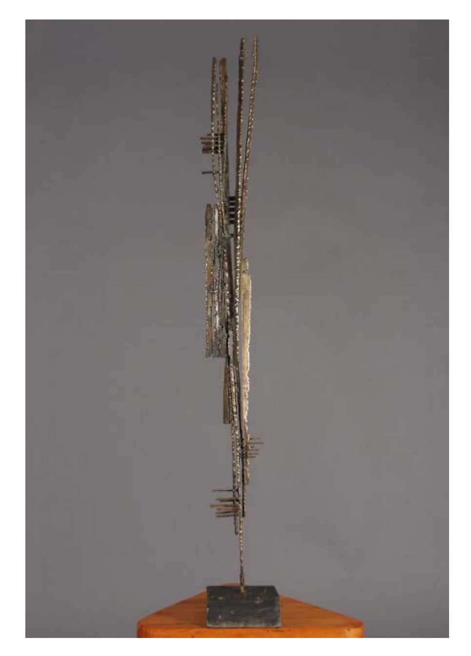
Alain Douillard Sculpture, c.1970 Metal 48 x 5.5 x 4inches 121.9 x 14 x 10.2cm