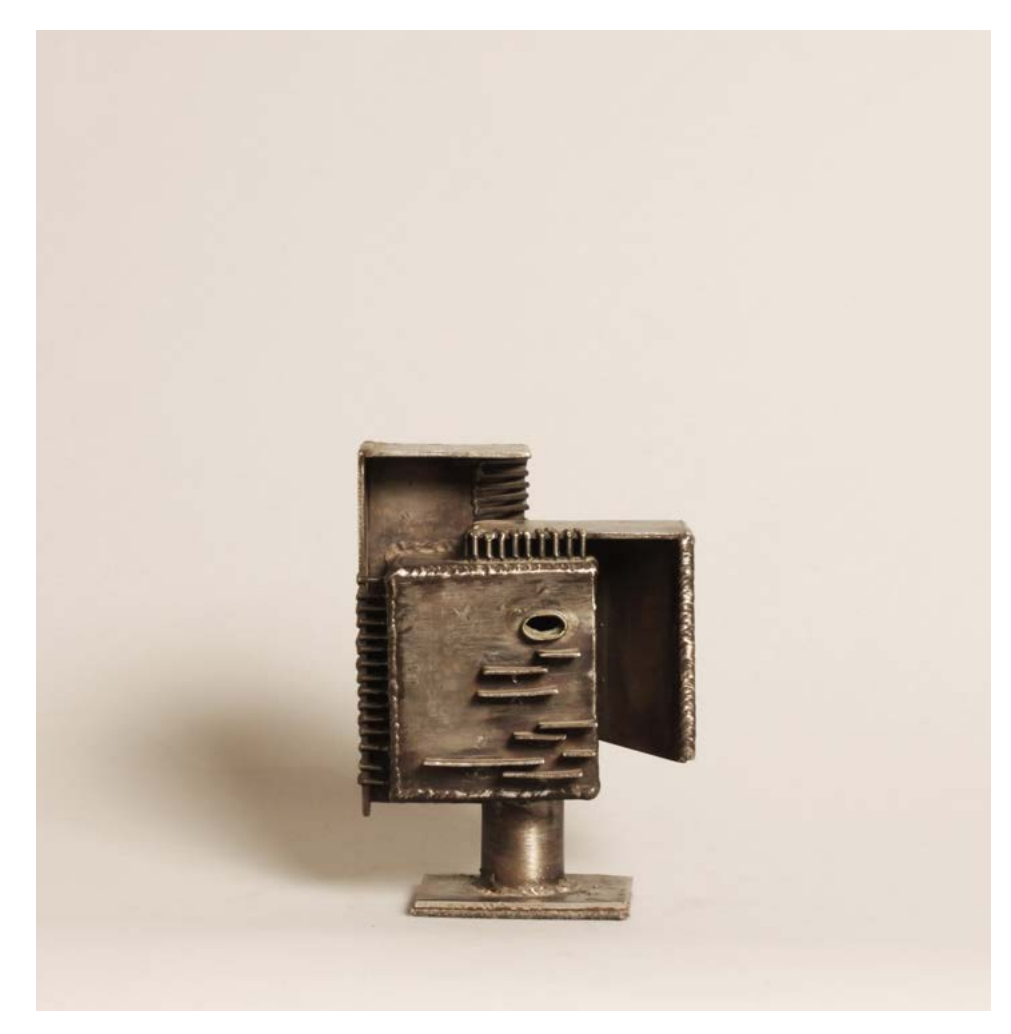
Alain Douillard Sculpture, c.1970 Metal 12.4 x 4 x 3.5inches 31.5 x 10.2 x 8.9cm