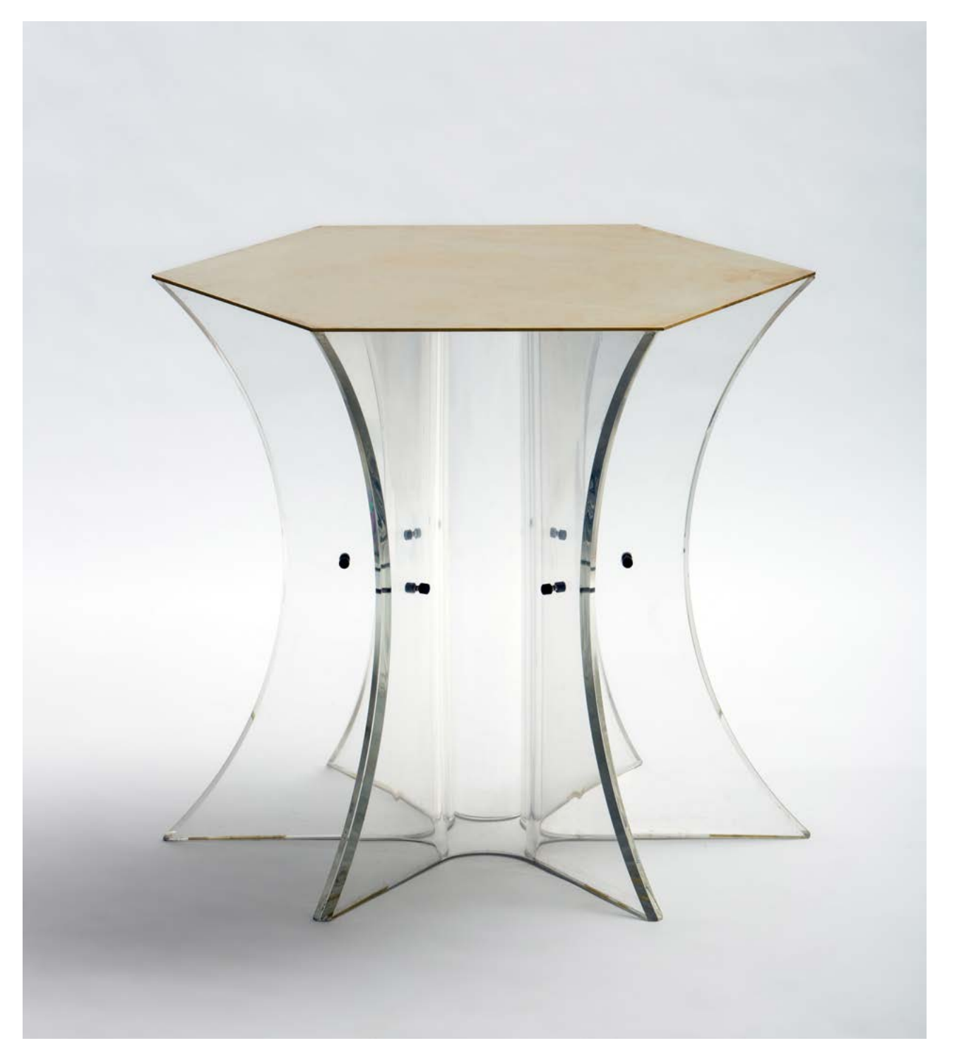
Atelier A / Francois Arnal Gueridon, c. 1969 Plexiglas, brass 25.75 H x 25.5 x 29.5 inches 65.4 H x 64.8 x 74.9 cm Commissioned by Henri Samuel