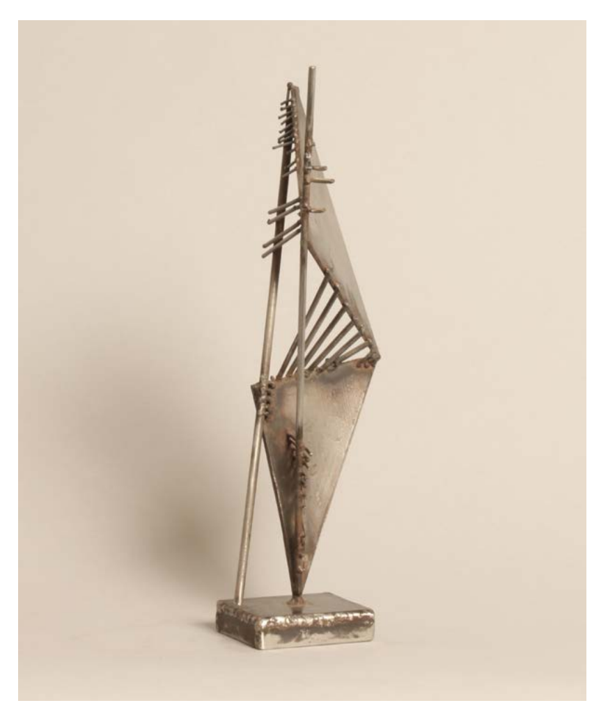
Alain Douillard Sculpture, c.1970 Metal 15 x 3.25 x 2inches 38.1 x 8.3 x 5.1cm