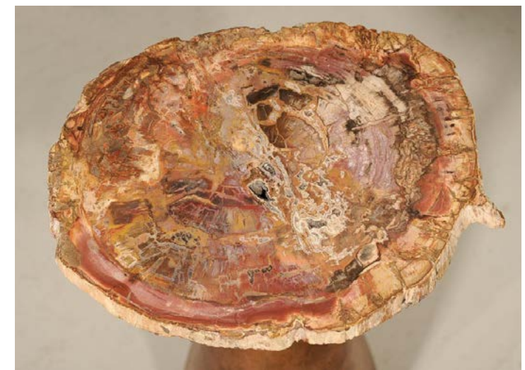
Philippe Hiquily Side Table, 1990 Petrified wood, ceramic 22.83 x 12.99inches 58 x 33cm