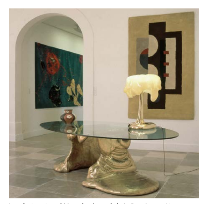
Installation view: Objets d'artistes, Galerie Beaubourg, Vence, France, 2000.

Expansion Table, 1977 Bronze Base: 28.35 H x 90.55 x 35.43 inches 72 H x 230 x 90 cm Glass: 110.25 x 69.5 inches 280 x 177 cm Valsuani Foundry Edition of 8 + 4AP EA 3/4 Signed and numbered with stamp of foundry