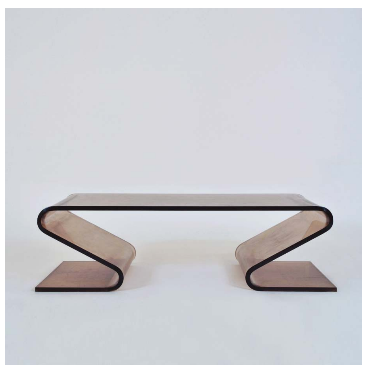
Atelier A - Francois Arnal Z Table, 1970 c. Plexiglas 15 x 50 x 19.5inches 38 x 127 x 49.5cm