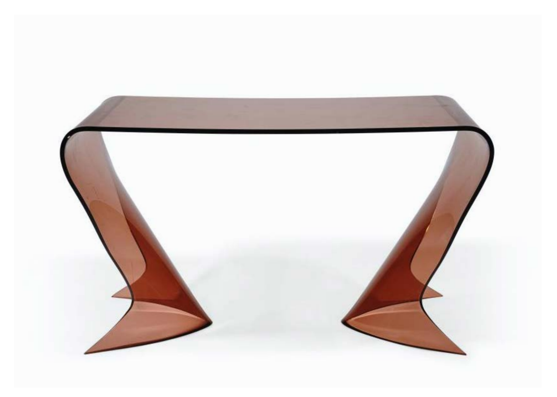
Francois Arnal - Atelier A Elice Console, 1968 Smoked Plexiglas 27.17 x 48.43 x 23.62inches 69 x 123 x 60cm For Atelier A