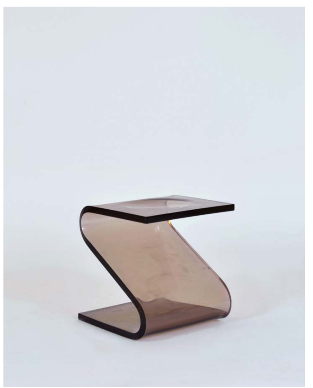
Atelier A - Francois Arnal Z Stool, 1970 c. Plexiglas 15 x 15 x 19.5inches 38.1 x 38.1 x 49.5cm 3 available