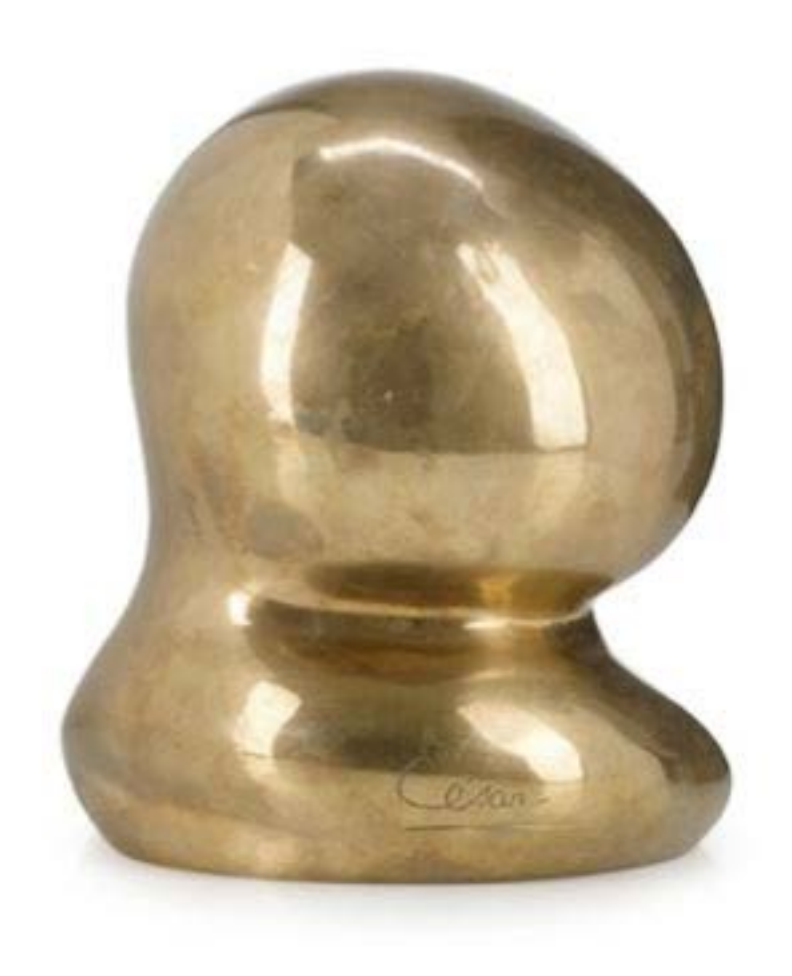
César Expansion Polished bronze 7.09inches 18cm Edition 80 of 99 Signed: "César"