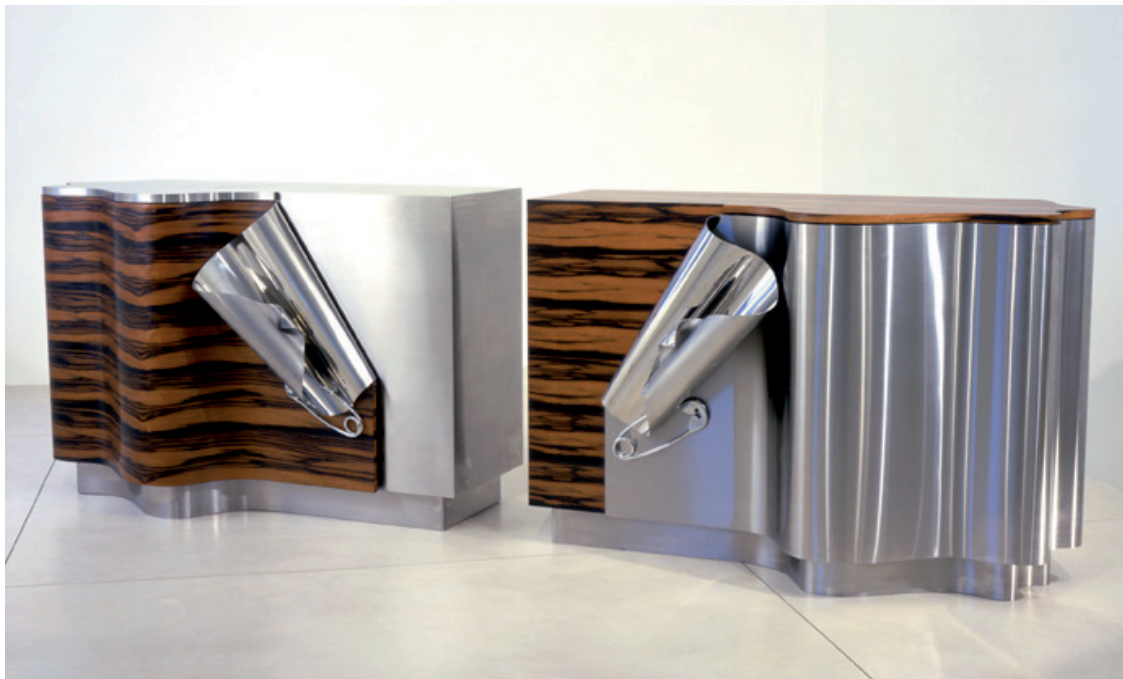
Drape Cabinets, 2005

For additional information or to request publication quality images, please contact: