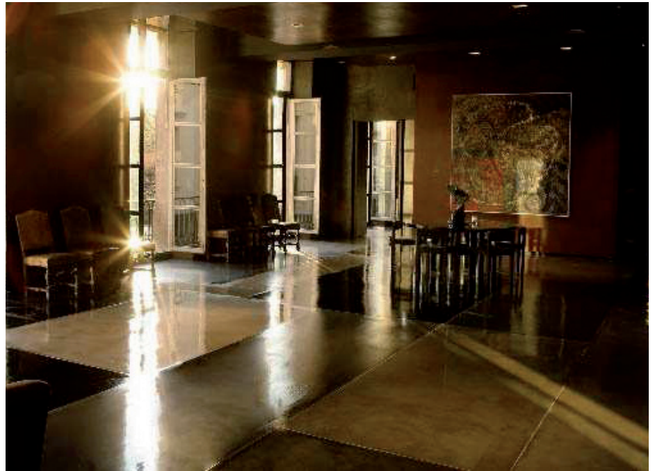
Townhouse, Place des Vosges, Site of Pergay exhibition

In March 2012, Pergay will unveil the exhibition Maria Pergay: Place des Vosges in a grand mansion on the Place des Vosges in Paris. This quintessentially Parisian location holds special significance for Pergay, who opened her first public emporium there more than fifty years ago. Curated by Pergay herself and jointly organized by Demisch Danant, New York and JGM Gallery, Paris, the retrospective will bring together exceptional examples of furniture, lighting, and decorative objects created by the designer between the 1950s and the present day, featuring an extraordinary new design created expressly for the exhibition incorporating a 17th century slice of wood from Marie Antoinette's famed gardens at Versailles. Archival pieces on loan from major public and private collections will be presented, along with personal ephemera and photographs from the designer. The exhibition will also feature the first viewing of a documentary film on Maria Pergay by the well known photographers Jenny Gage and Tom Betterton.