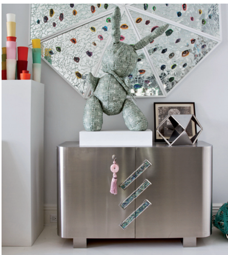
Mother of Pearl Cabinet, 2005. Home of a private collector