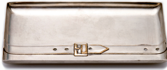
Belt Tray, 1957