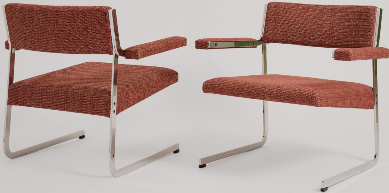
Joseph-André Motte Pair of Rigel Armchairs, 1965 Chromed steel, foam, fabric 28.74 H x 25.2 x 29.53 inches 73 H x 64 x 75 cm Seat height: 15.4 inches (39 cm) Edition Steiner (JM3272)