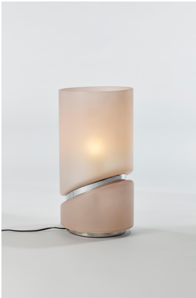
Alain Carré Lamp , c. 1980s Chromed metal, opaque glass 18.11 H x 9.06 D inches 46 H x 23 D cm Edition Verre Lumiere (AC0001)